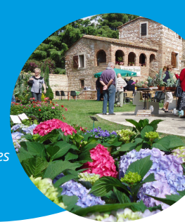
Floralies de Juhègues

At the entrance to the campsite, a pretty cycle path takes you to the heart of the Rivesaltes vineyard. Discover typical villages perched on the green hills. In the background, Mount Canigou invites you for a hike in beautiful natural surroundings.